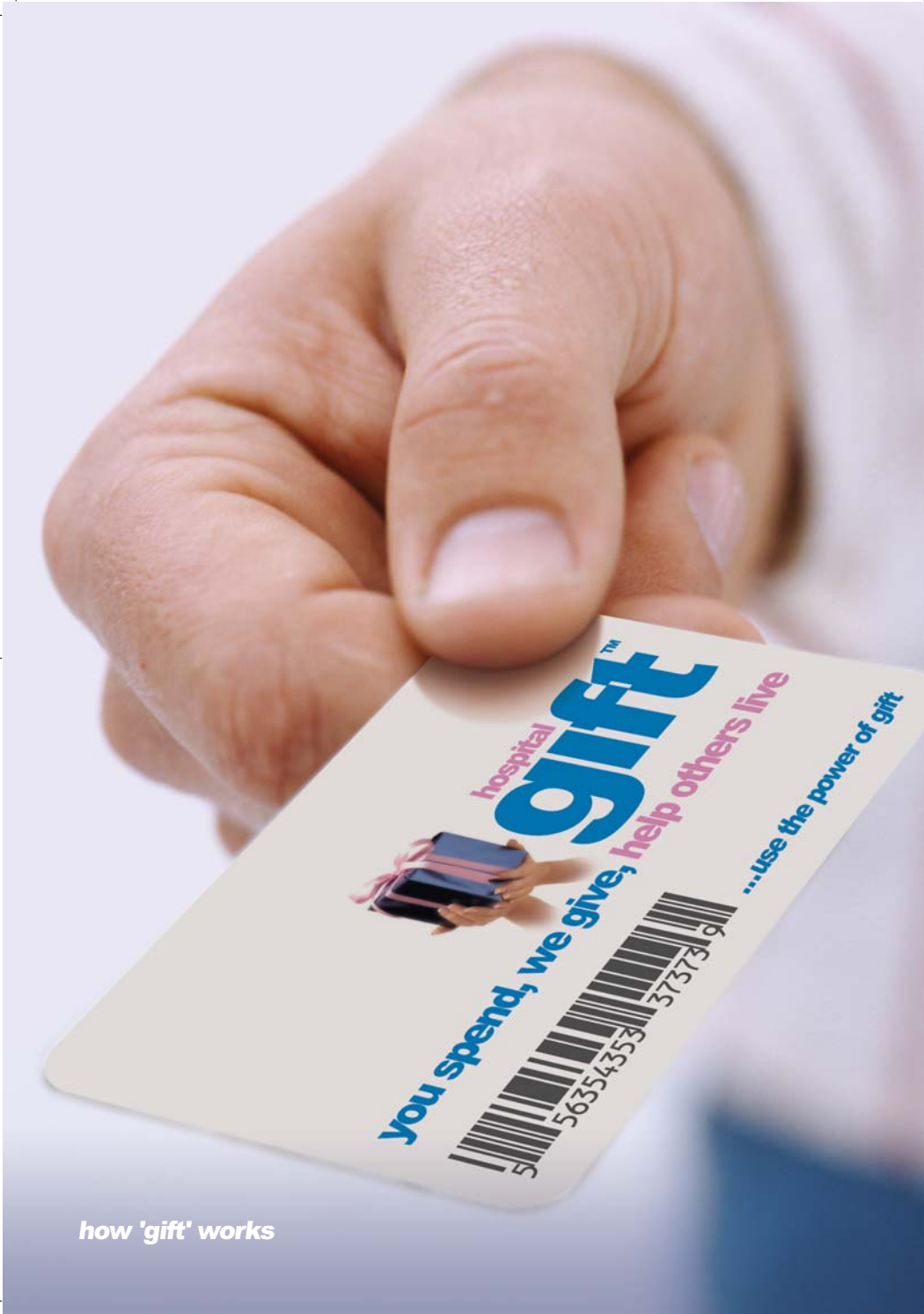
how 'gift' works